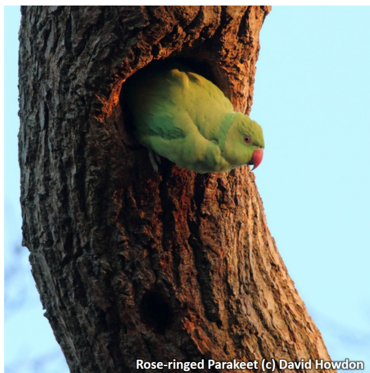
Rose-ringed Parakeet

Most of these record cards haven't been examined since they were first written by the original recorder, so you might discover something surprising!