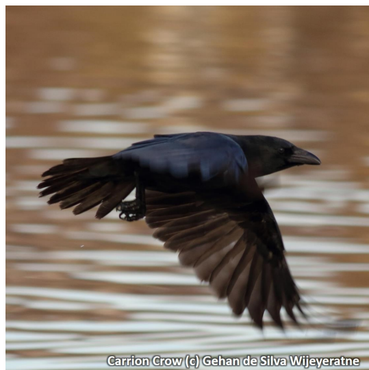
Carrion Crow

The London Bird Records were first compiled in 1908 for London north of the Thames, (retrospectively from 1887), and in 1914 for London south of the Thames (from 1902). After these dates observations of birds were compiled annually. They were originally published in the London Naturalist, but from 1926 onwards published separately as the London Bird Report. The first set of records up until 1943 was compiled on foolscap sheets. In 1943 they were recompiled as part of the data collection for the publication of "Birds of the London Area since 1900", which covered observations up to 1950 and was published in 1957. These records were also on foolscap sheets. From 1951 until 1987 submitted observations were recorded on 8x5 record cards. These cards were filed first by year, then species, then by vice-county. These records are hosted by GiGL, which is London's LERC (Local Environmental Records Centre) and are the data custodians of the LNHS.