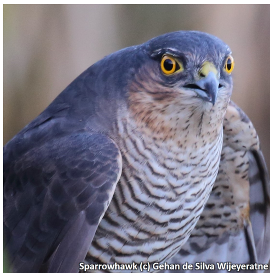
Sparrowhawk

The main goal of this project is to recover historic species data so that the information can be used by ecologists, conservationists, decision-makers and anyone else who is interested. This will improve knowledge of bird populations and distribution in London, and allow historical bird data to be made available for scientific research.