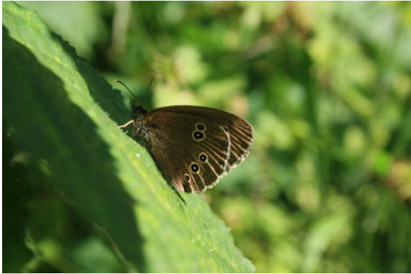
Ringlet in Harrow garden, June 2017