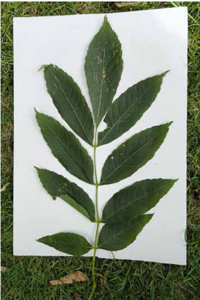
Fraxinus excelsior leaf