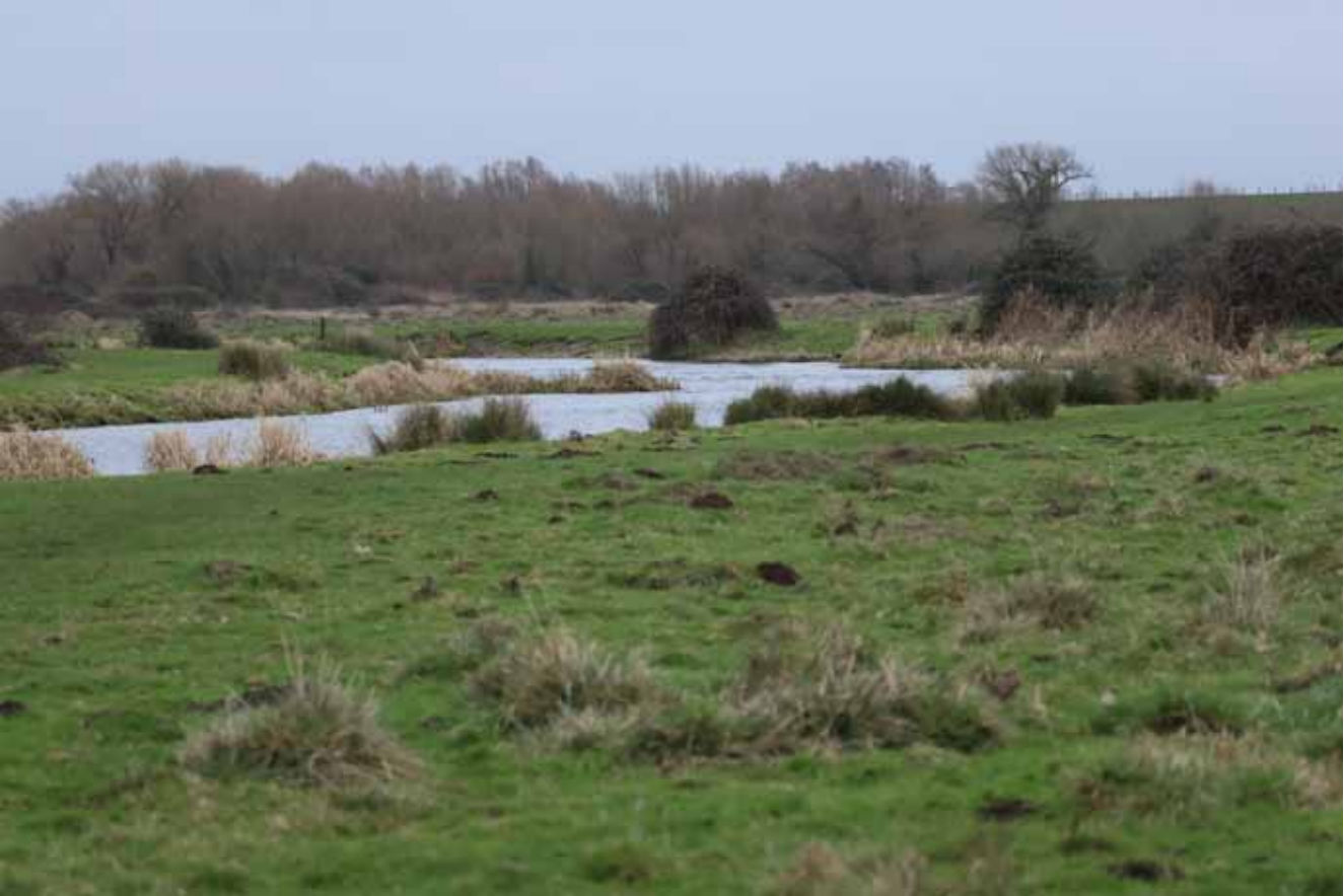
The River Colne runs through Staines Moor

A total of 20 people met up on a cold day. To manage expectations the group were briefed initially that owls were unlikely this time (it's a quiet year for Short-eared Owl, and the resident Barn Owl had died). The rough grassland site is home to the oldest anthills in the U.K, some 22 years old, and many molehills.