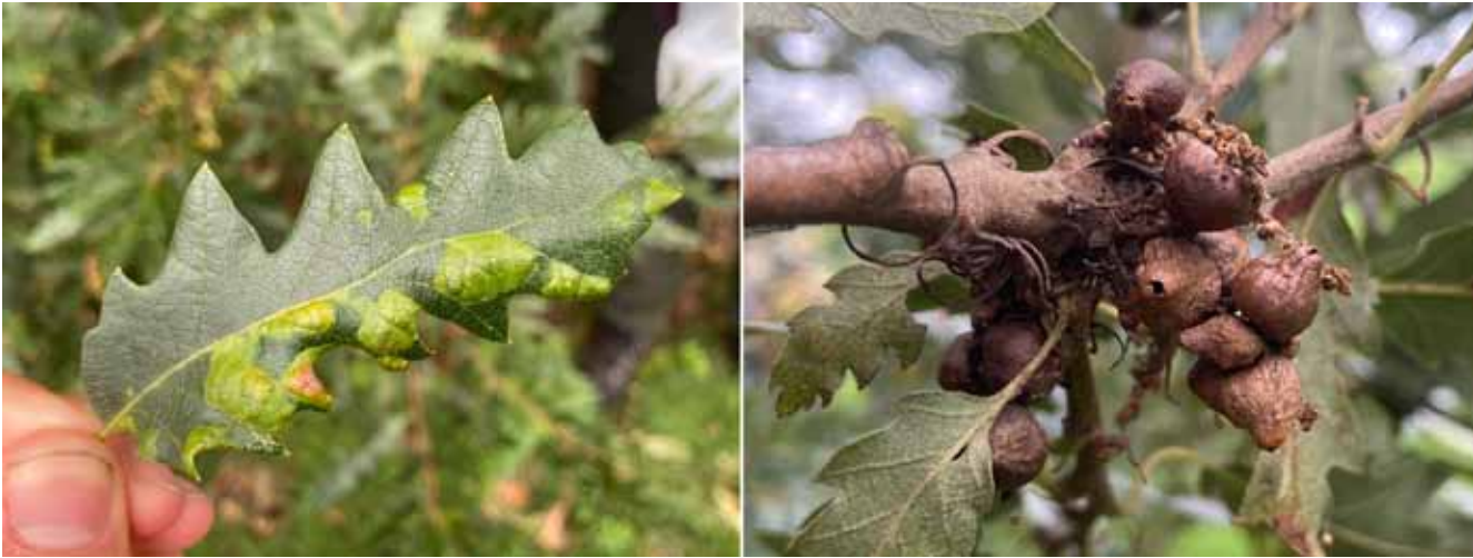
Two galls on Turkey Oak Quercus cerris : bulge-like deformations on the leaf caused by the mite Aceria cerrea (left) and hardened woody galls on catkins caused by the sexual generation of the wasp Andricus grossulariae (right).