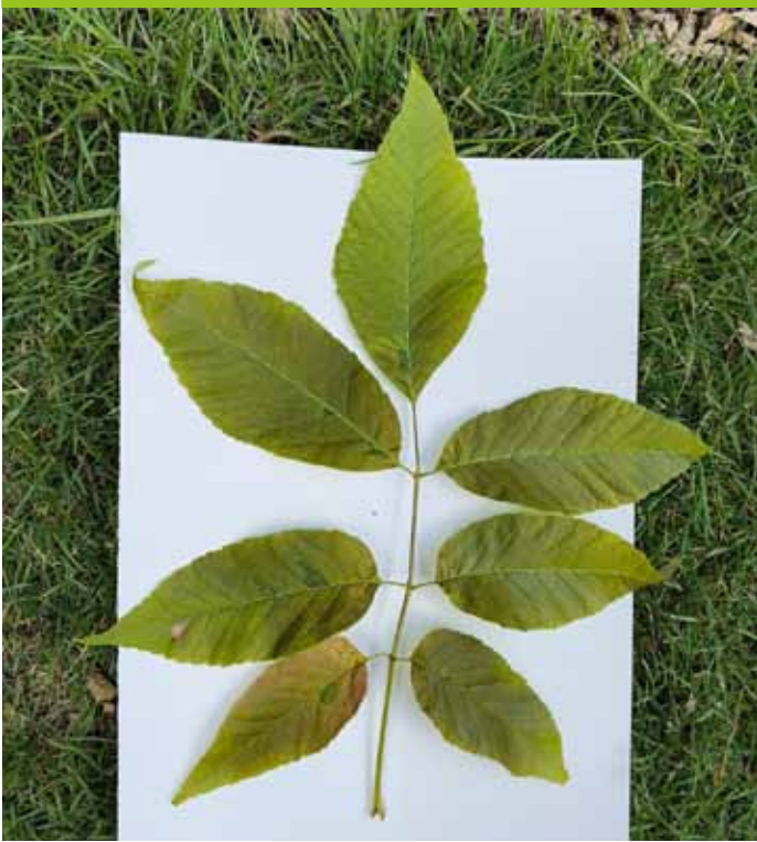
Fraxinus americana