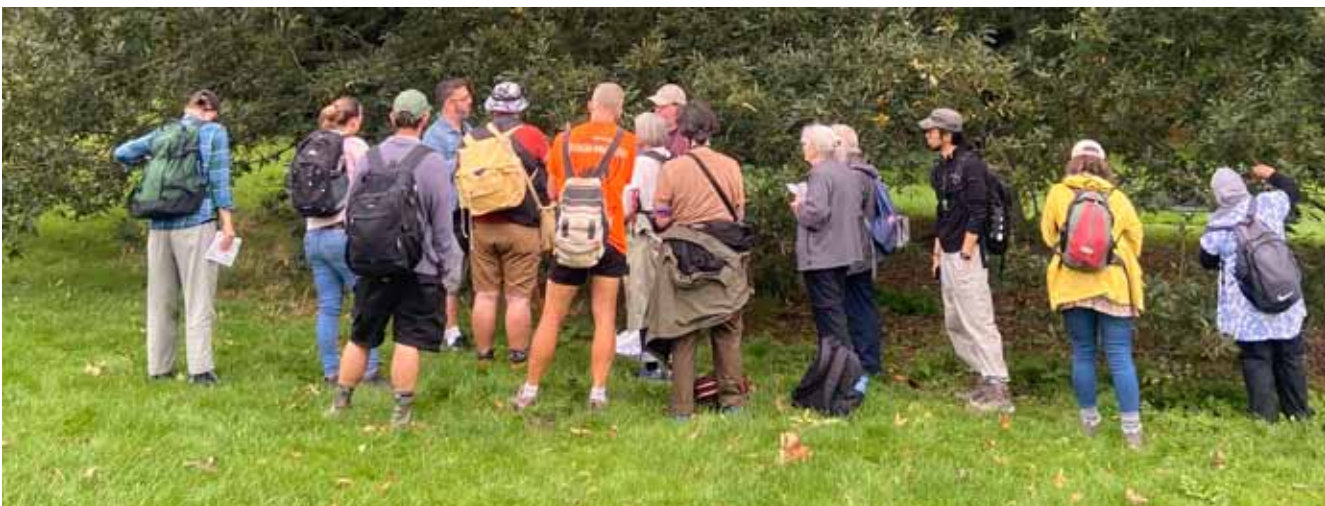
Looking for galls on Turkey Oak Quercus cerris

One of the best places to look for galls is on oak trees, around 50 different gall-causing species are