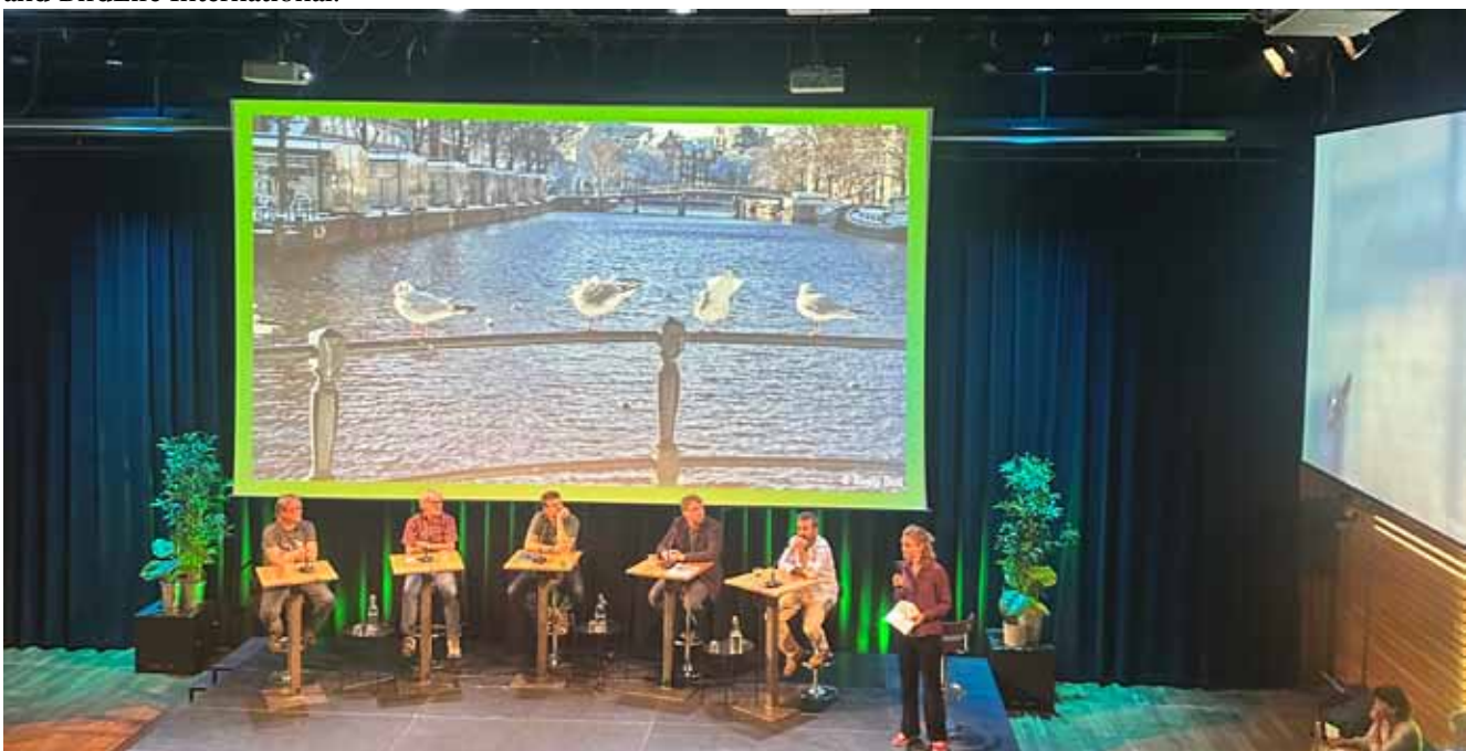
Amsterdam Bird Festival