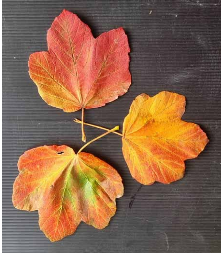
Acer opalus , autumn leaves

We were fortunate to see the very rare Prunopitus andina , which on a cursory glance again had similarities with Taxus baccata , but with some marked differences; the bark was less coloured, and the leaves were held in whorls instead of pectinate combs. Also, the fruit of this Chilean Plum Yew is dark blue-purple rather than red; and it’s said to be not only edible, but downright delicious,