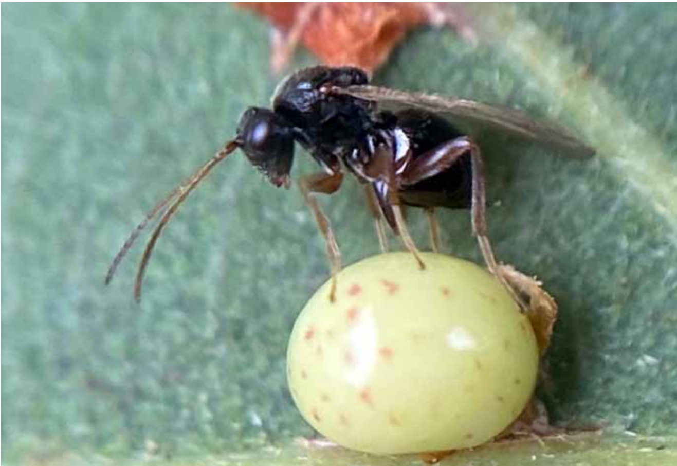
Oyster Gall and Neuroterus anthracinus on underside of Sessile Oak Quercus petraea leaf

Common Nettle ( Urtica dioica ), and galling caused by the mite Acalitus brevitarsus on the leaves of Italian Alder ( Alnus cordata ). Though not typically considered galls, several powdery mildews, a group of fungi which form white dusting on plants during autumn, were also spotted, including the uncommonly recorded Golovinomyces bolayi on Prickly Lettuce Lactuca serriola .