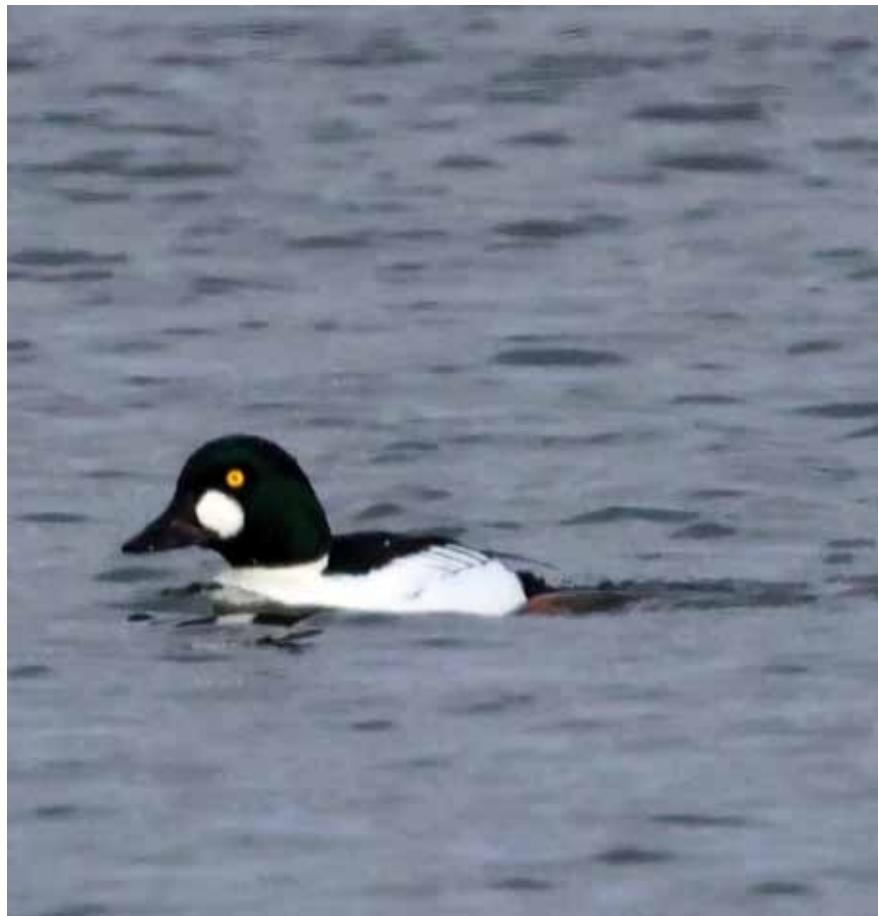
Male Goldeneye