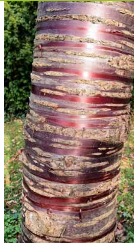
Bark of Prunus mackii (left) and Prunus serrula (right)

down at right angles, and had teeth ending in fine transparent tips. At this time of year its large white bracts were long gone, so the names of Handkerchief, Dove or Ghost Tree did not resonate as they would in late spring.